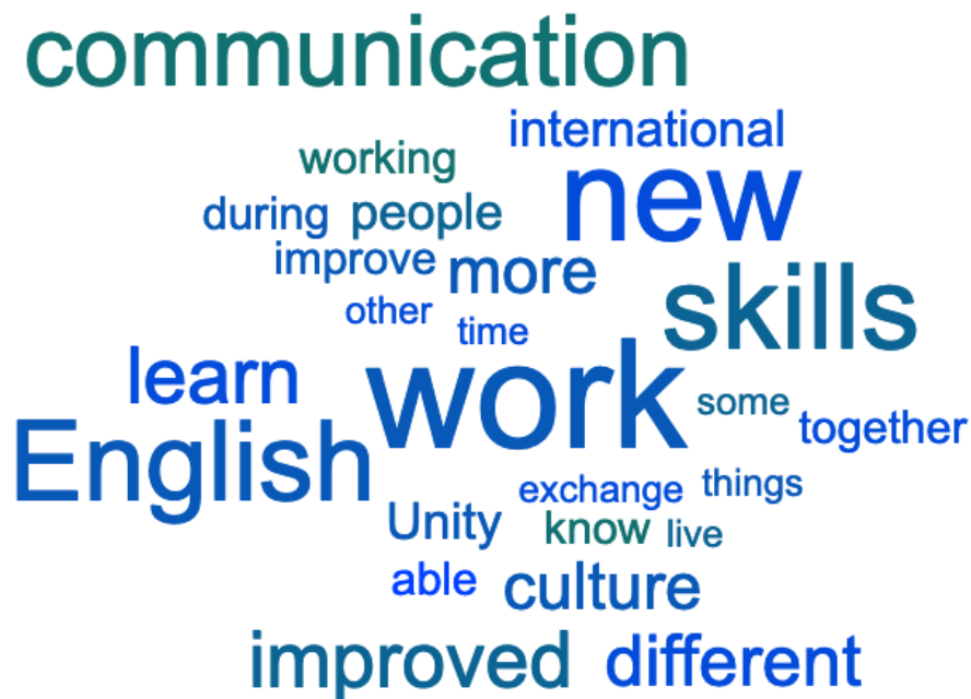
Figure 3: Word cloud from post stay survey (see Appendix); all words with at least six mentions (December 2022).

Learning to adapt to a new environment is seen as extremely valuable, especially by international organizations in Switzerland. When building a relationship with a new client based in a different country, it is good to be aware of potential cultural differences, how to navigate business challenges, and how to communicate. The apprentices experienced the application of these required skills in international collaborations and through that developed an important new skill set for the final year/s of their ICT apprenticeships.