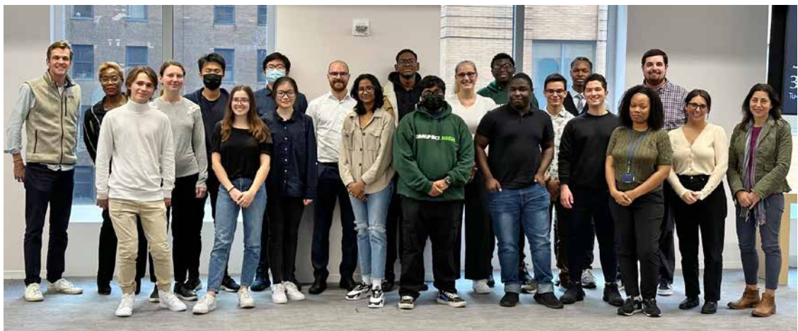
Swiss apprentices comparing teaching systems in Switzerland to those of the USA with apprentices at J.P. Morgan (1 November 2022)

Apprentice comment from post stay survey, December 2022